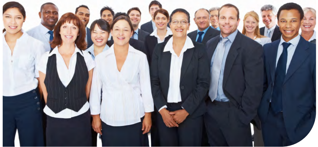
EXHIBIT at MBA/MW's Mid-Atlantic Lender Conference and/or SPONSOR the Event